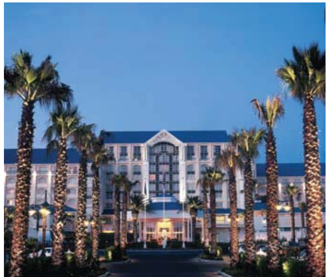
Table Bay Hotel