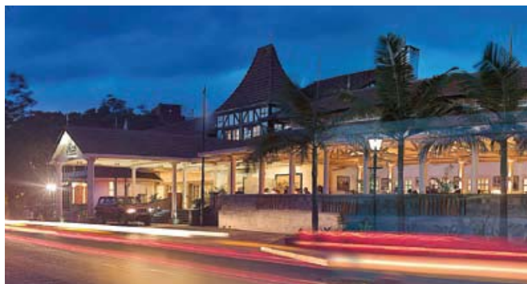
The Fairmont Norfolk Hotel