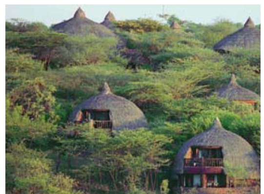
Serengeti Serena Lodge