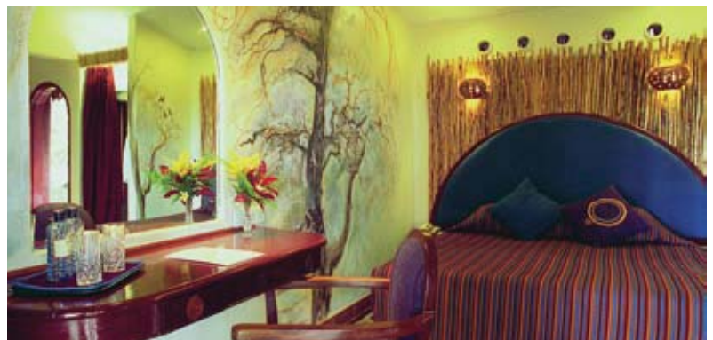
Amboseli Serena Lodge