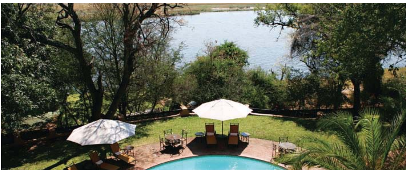
Chobe Game Lodge