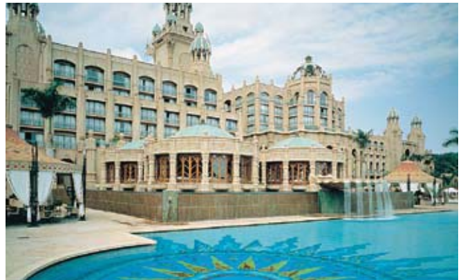
The Palace of the Lost City

Here are Wildlife Safari's five favourite, and most popular properties in South Africa. The Melrose Arch Hotel in Johannesburg's northern suburbs is a luxury "hip" hotel offering an outstanding guest experience with some unique twists. The Palace of the Lost City at Sun City is an iconic resort hotel, famous globally, and any visit to South Africa is incomplete without a stay at this incredible hotel. We currently have three favourite Cape Town hotels, all situated at the V & A Waterfront. The V & A Hotel, the original hotel, still retains its charm and inobtrusive service. The Table Bay Hotel is a large world class hotel with all the facilities with views to both Table Mountain and Atlantic Ocean. The Cape Grace Hotel is a small, exclusive hotel that is more like a private club than hotel. Wildlife Safari has a much larger selection of hotels, lodges and resorts throughout South Africa, call us for details.