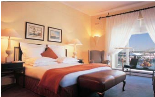
V & A Hotel