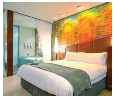
Melrose Arch Hotel