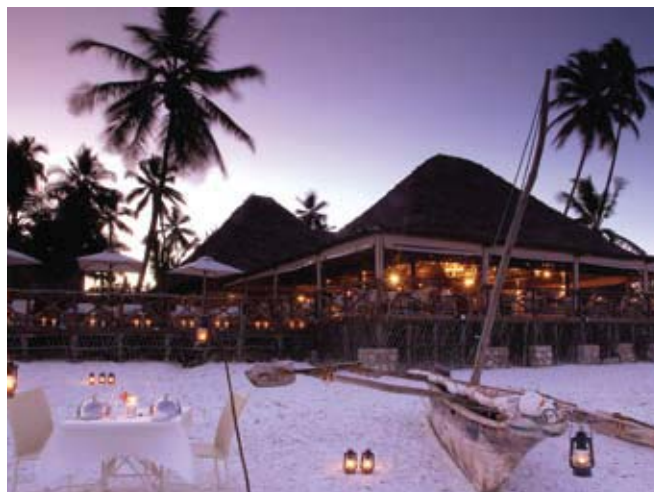
The Fairmont Zanzibar

The Fairmont Zanzibar is a luxury beachfront resort on the eastern side of Zanzibar island and the perfect place to spend three, or more, days relaxing after "The Fairmont Safari" and enjoying the water sports and spa facilities.