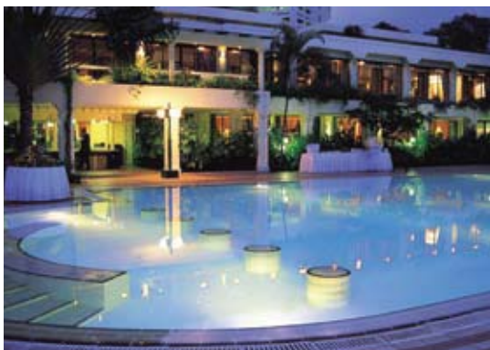
Nairobi Serena Hotel