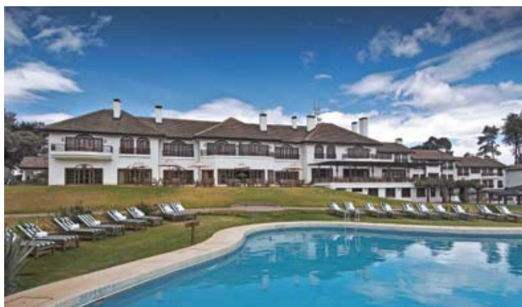
Mount Kenya Safari Club