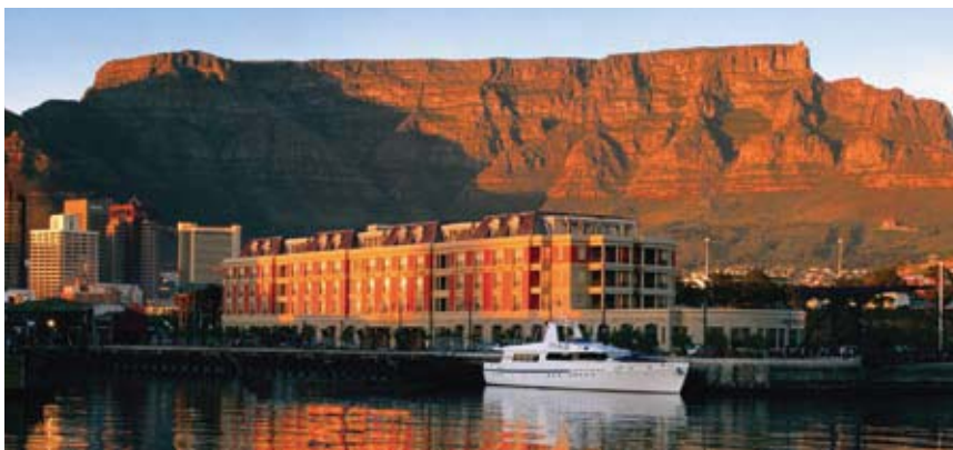
Cape Grace Hotel