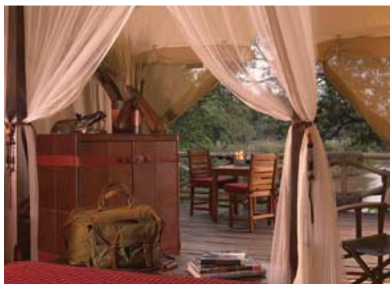
Mara Safari Club