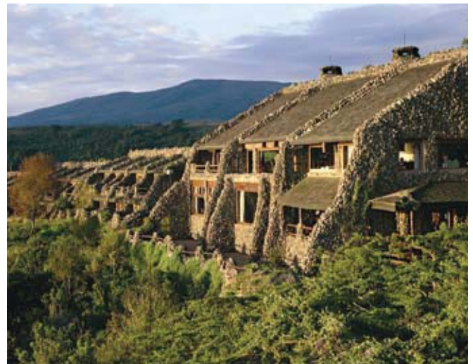
Ngorongoro Serena Lodge

Wildlife Safari enjoys a long relationship with Serena, we are also a significant shareholder, so Wildlife Safari guests receive the warmest welcome, best rooms and outstanding service.