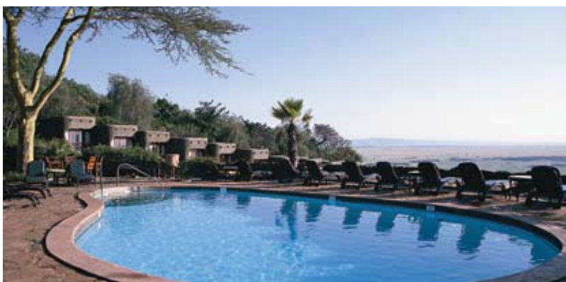
Mara Serena Lodge