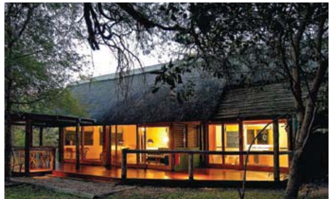
Savute Safari Lodge